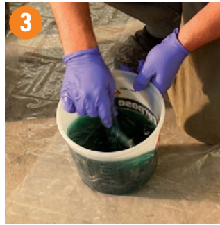
3 Mix ingredients