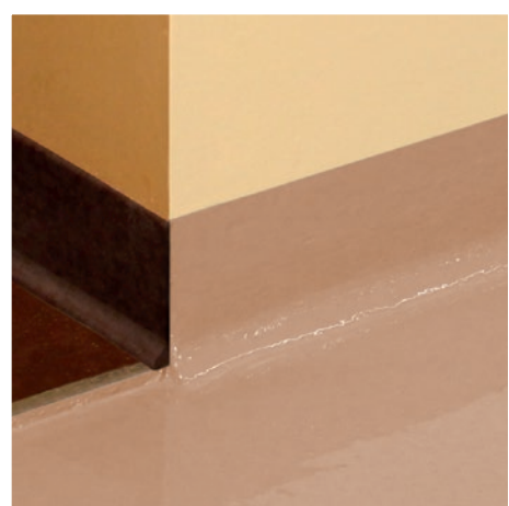
USE WITH ANY COATING