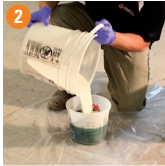
2 Add dry sand