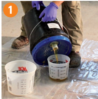
1 Combine parts A and B