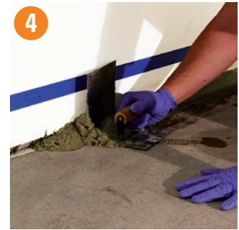
4 Apply and trowel to shape

FormCove™ installation takes one third of the time and half the material cost of traditional systems. The flexible material accommodates substrate variations, forming a seamless cove base that seals between wall and floor. Other coving methods involve purchasing pre-cut pieces, cutting them to fit, and installing them with messy adhesives. FormCove™ eliminates these problems. Mixed on-site with dry sands, the plural component urethane is easily spread with a cove trowel. With a long pot life (10 minutes), the installers can mix a large batch and cover hundreds of feet. Quick cure time (30 minutes) allows for one-day project completion.